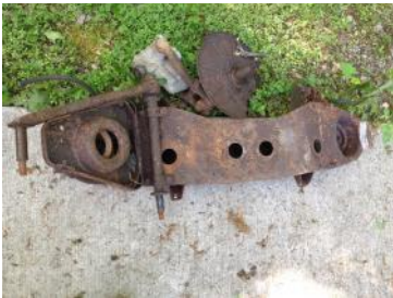
Left on the doorstep...

It’s a little different now. I’m not about to remove the radiator and front fenders just to replace a fan belt. I tried just about every 9/16” wrench devised by man: end wrenches, ratchet end wrenches, claw-foot wrenches, socket wrenches, ratchet socket wrenches, ratchet socket wrenches with extensions, ratchet socket wrenches with extensions and universal joints. ‘Tried ‘em down from above the engine; ‘tried ‘em up from down below the car. Finally, I