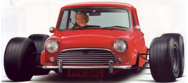
La photo ci-dessus est une image simulée.

Allen Bachelder bachldrs@comcast.net Call 1-810 824 4188