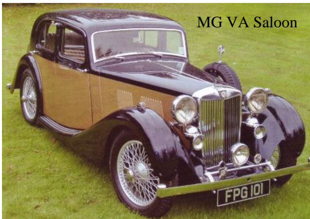
MG VA Saloon